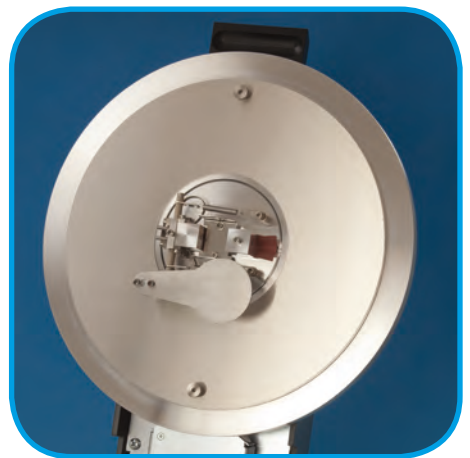
Carbon rod evaporation insert