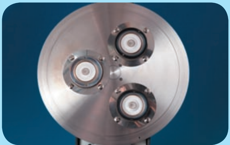
Triple sputter head with automatic shutter control