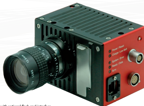
Q-MIZE HD v2 90° with optional flash card interface