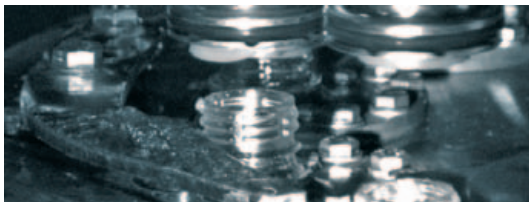
Industrial troubleshooting on a bottling line