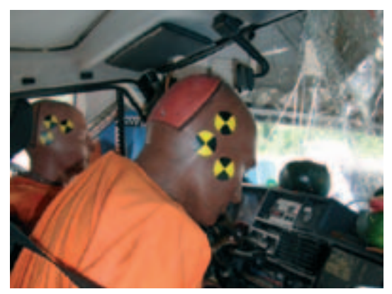
Car crash (on board)