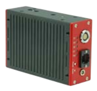
The TRI-VIT backplate is flat for easy installation - all connectors, buttons and LEDs at the side