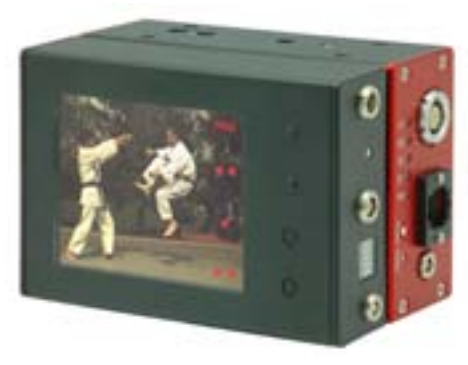
TRI-VIT with optional Display/control unit