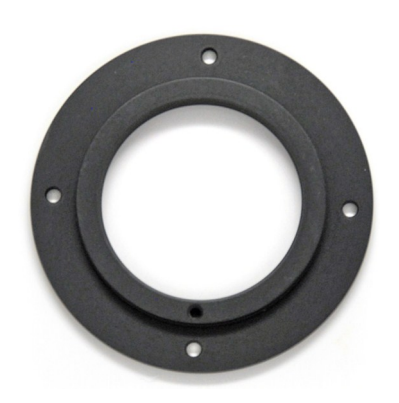
Fig. 1 #100 Mounting Ring