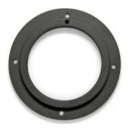
Fig. 1 #101 Mounting Ring