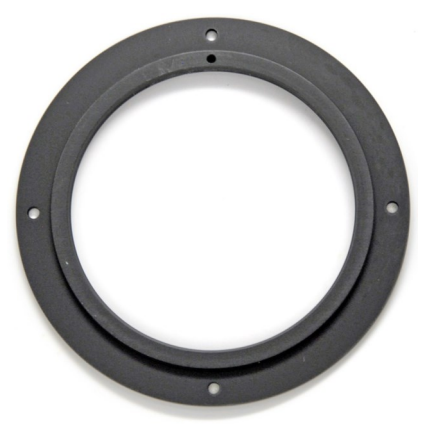
Fig. 1 #102 Mounting Ring