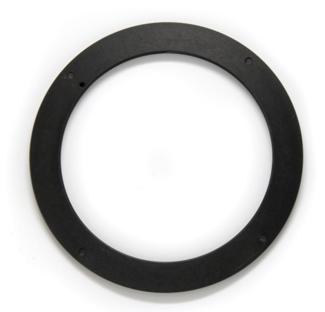
Fig. 1 #103 Mounting Ring