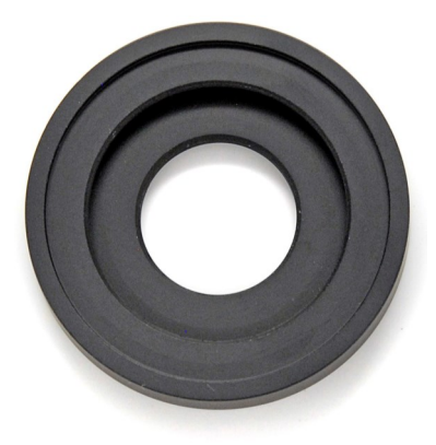
Fig. 1 #106 Female C Mount Video Adapter