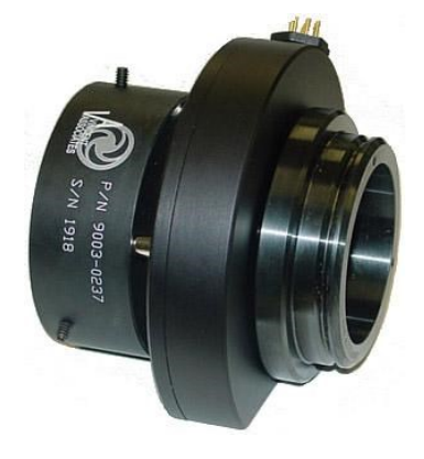
Fig. 1 #24 Olympus Type Microscope Mount Set