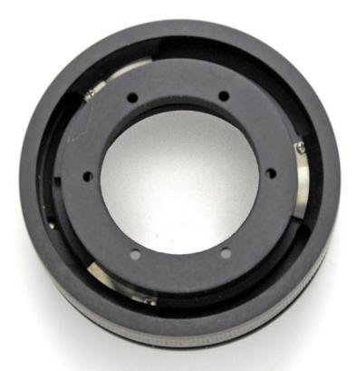
Fig. 1 #27 Nikon Type Microscope Mount Set